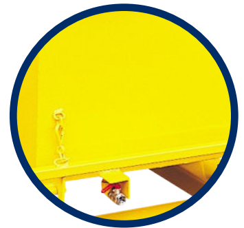
Drain Tap & Filter

Allows skip to be lifted by overhead crane