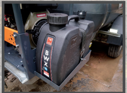
GENEROUS 550MM TANK MOUTH & INTERNAL TANK Baffle