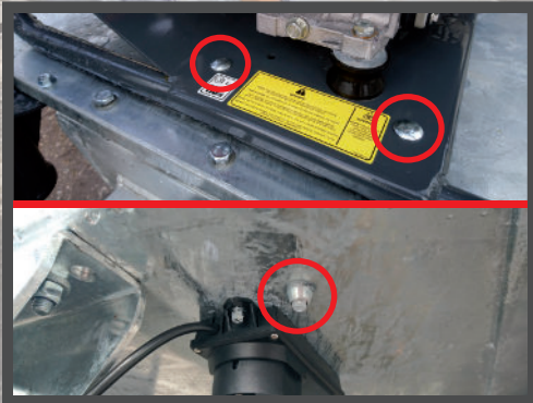
ANTI-THEFT BOLTS SECURING THE PRESSURE WASHER TO THE CHASSIS