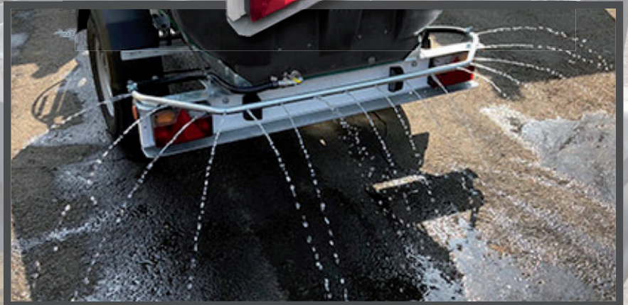
GRAVITY-FED SPRAY BAR OPTION FOR DUST SUPPRESSION