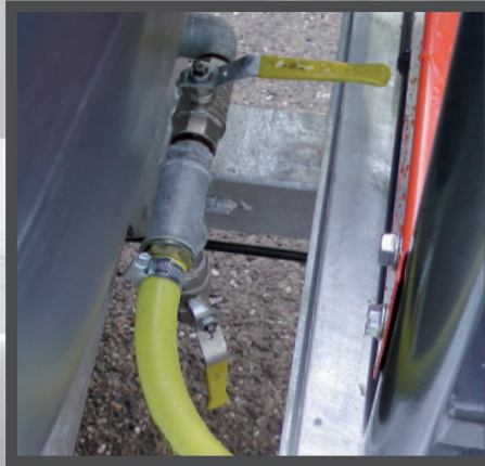
TANK AND PUMP DRAIN TAPS FOR SAFE TRANSPORTATION & PREVENT FROST DAMAGE