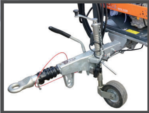
40MM TOWING EYE, BREAK-AWAY CABLE & TELESCOPIC JOCKEY WHEEL / JACK (OPTIONAL 50MM BALL HITCH ALSO AVAILABLE)