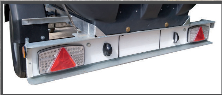
LED LIGHTBOARD OPTION AVAILABLE COMPLETE WITH 13-PIN PLUG AND 7-PIN ADAPTOR