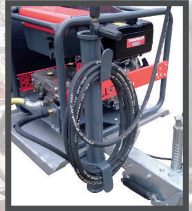
LANCE HOLDER INTEGRATED INTO THE TRAILER WITH HOSE STORAGE HOOKS