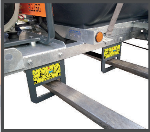
FORKLIFT POINTS FOR SAFE ON-SITE TRANSPORTATION