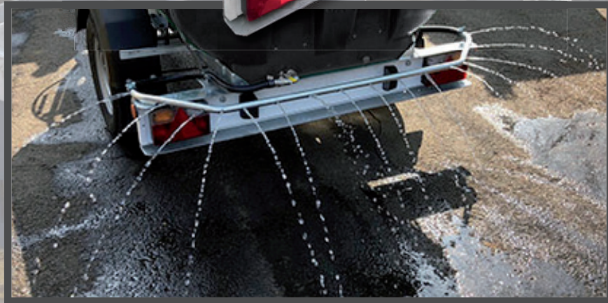
GRAVITY-FED SPRAY BAR OPTION FOR DUST SUPRESSION