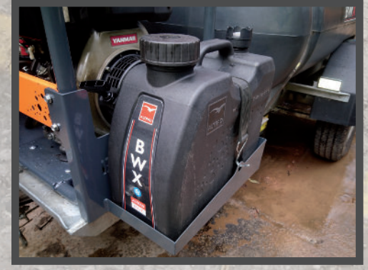
GENEROUS 550MM TANK MOUTH & INTERNAL TANK BAFFLE