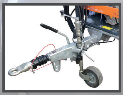
40MM TOWING EYE, BREAK-AWAY CABLE & TELESCOPIC JOCKEY WHEEL / JACK (OPTIONAL 50MM BALL HITCH ALSO AVAILABLE)