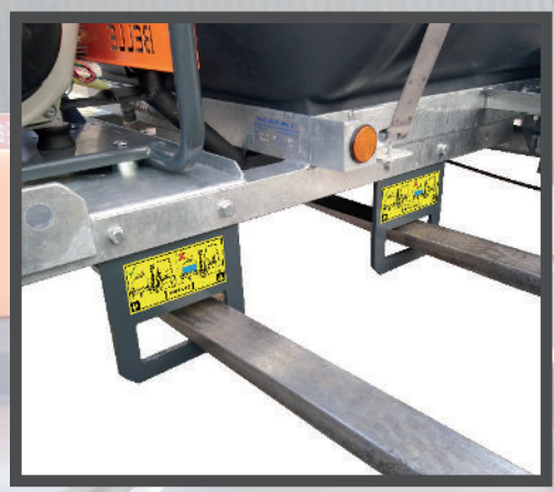
FORKLIFT POINTS FOR SAFE ON-SITE TRANSPORTATION