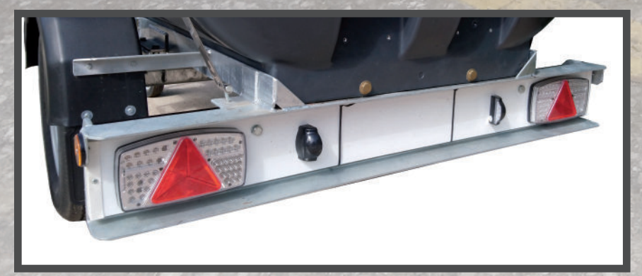
LED LIGHTBOARD OPTION AVAILABLE COMPLETE WITH 13-PIN PLUG AND 7-PIN ADAPTOR