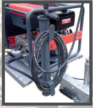
INTO THE TRAILER WITH HOSE STORAGE HOOKS