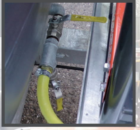
TANK AND PUMP DRAIN TAPS FOR SAFE TRANSPORTATION & PREVENT FROST DAMAGE