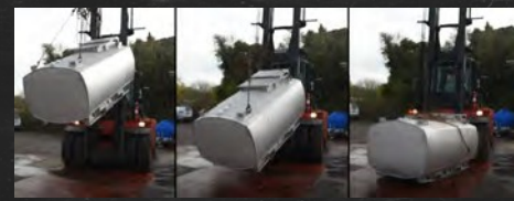
DROP TESTED AS REQUIRED UNDER ADR