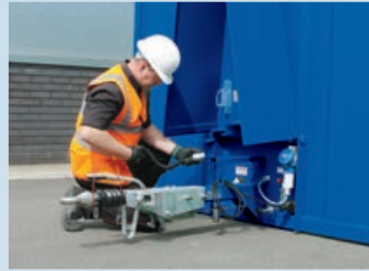
Close & lock canopy to protect towing facility