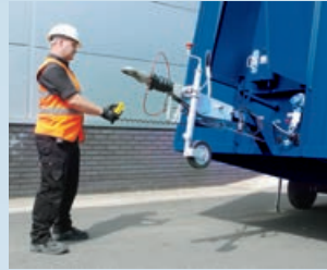
Lower unit to the ground and unplug controls