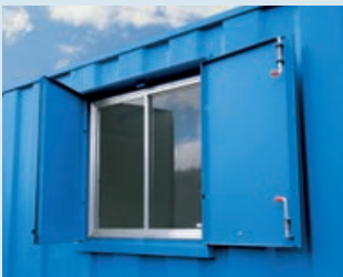
High security window shutters