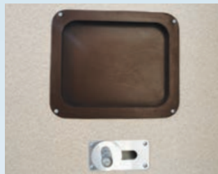
High secure double lock door with integral window and vent